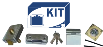
Electric lock Counter-plate for horizontal or vertical mounting external and internal cylinder