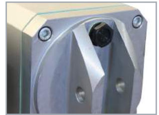
Back flange in solid machined aluminium