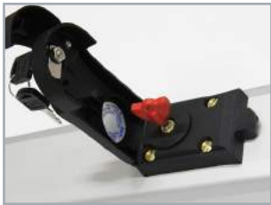
Release system protected by metal lock with release key at the inside