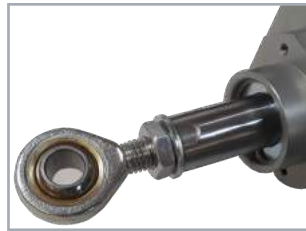
Round joint for stroke adjustment