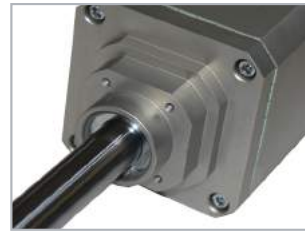
Front flange in solid machined aluminium