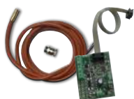
Kit Probe to manage low temperature + card LE + cable 6 Ft