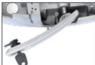
Release system through robust nylon lever and metal lock performance