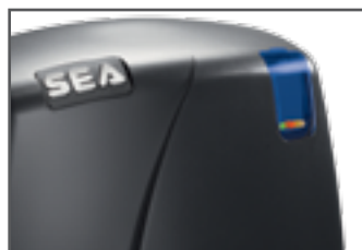
Led light (optional)

Available also model without limit switches