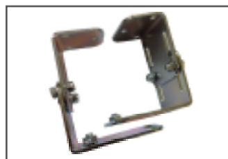
Adjustable bracket for chain magnetic limit